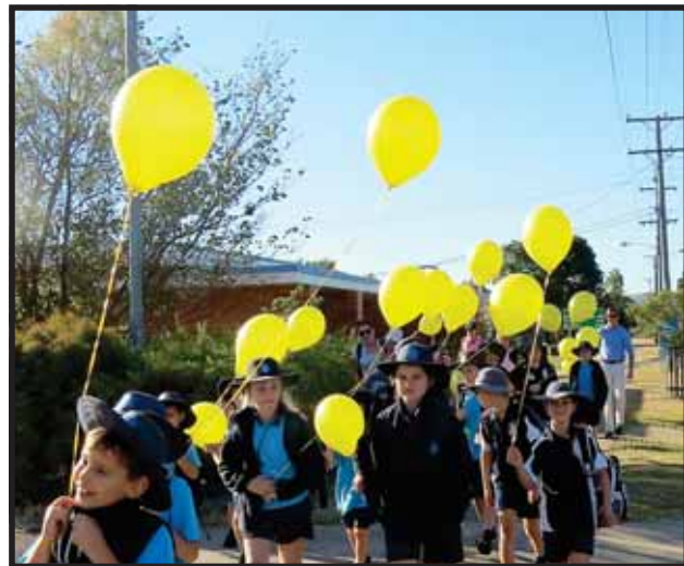
Yellow balloons made the day even more exciting for students as they walked to school.